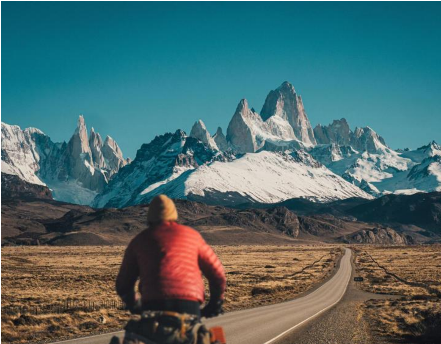
Cerro Torre, Aguja Poincenot and Fitz Roy peaks in Patagonia.