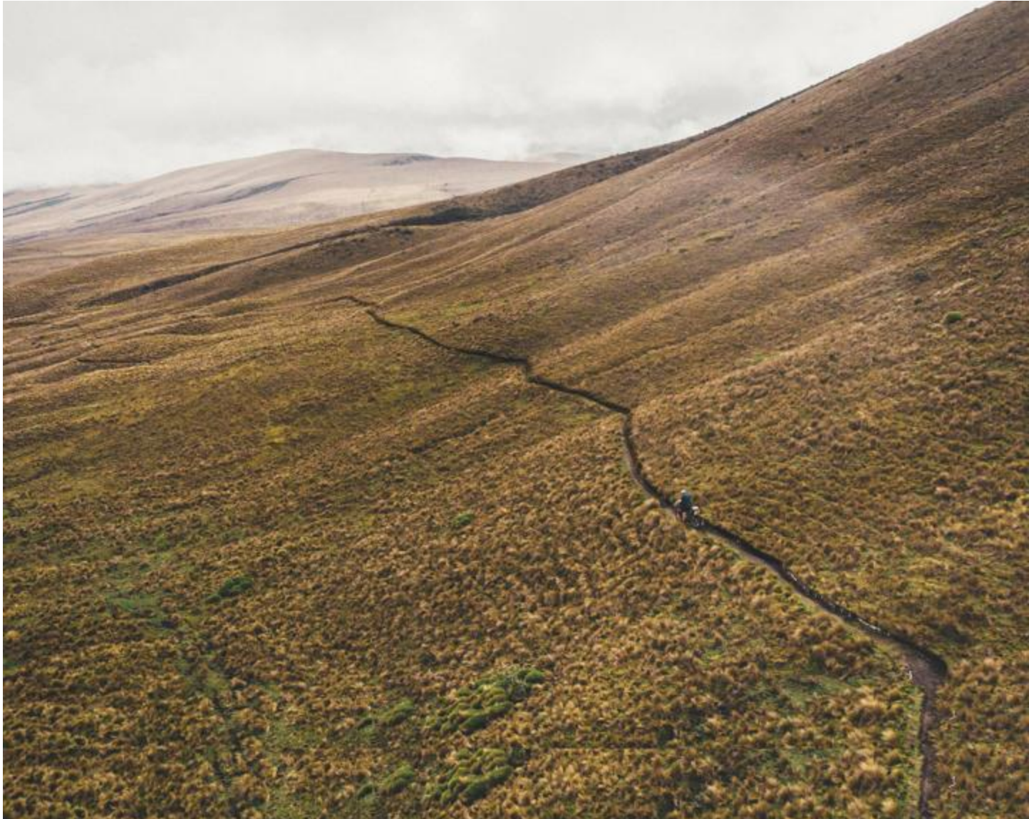
A shot of Ecuador from "Two Years on a Bike."